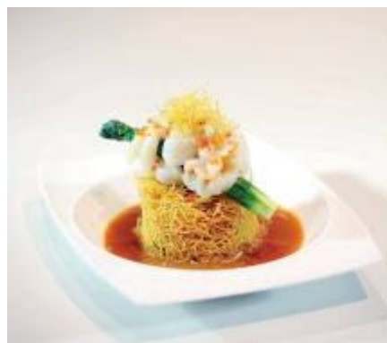
Crispy Egg Noodles with Prawns, Asparagus and Lobster in Shao Xing Sauce