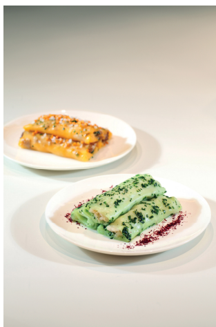
Steamed Spinach Rice Flour Rolls Stuffed with Scallops