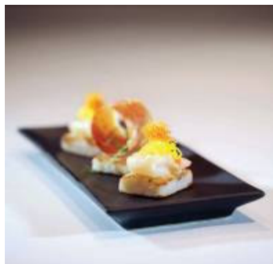
Pan-fried Turnip Cake with Parma Ham and Prawns in X.O. Sauce